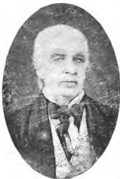
Samuel Nowlin First Mayor of Lynchburg.