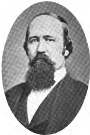
Judge Abner Wentworth Clopton Nowlin the Statesman.