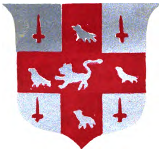
Dicere Jus Bonumque Nowlin Coat-of-Arms