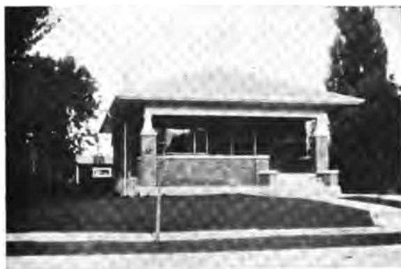
Some of Bailey B. Nowlin's Bungalows. Salt Lake City.