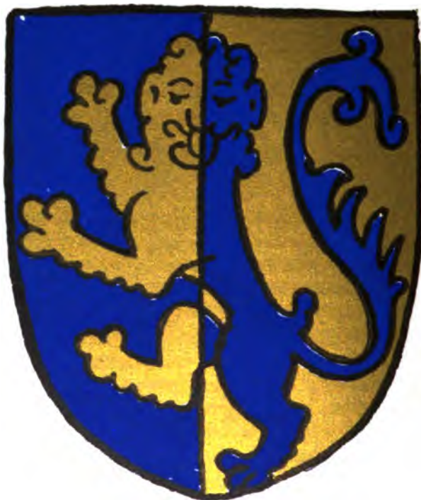
Vincit qui Patitur Stone Coat-of-Arms.