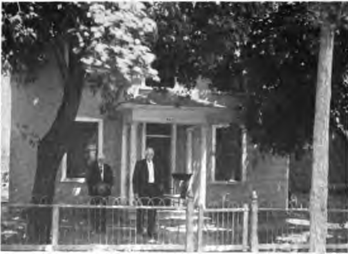
Historic 5-4-1, Salt Lake City.