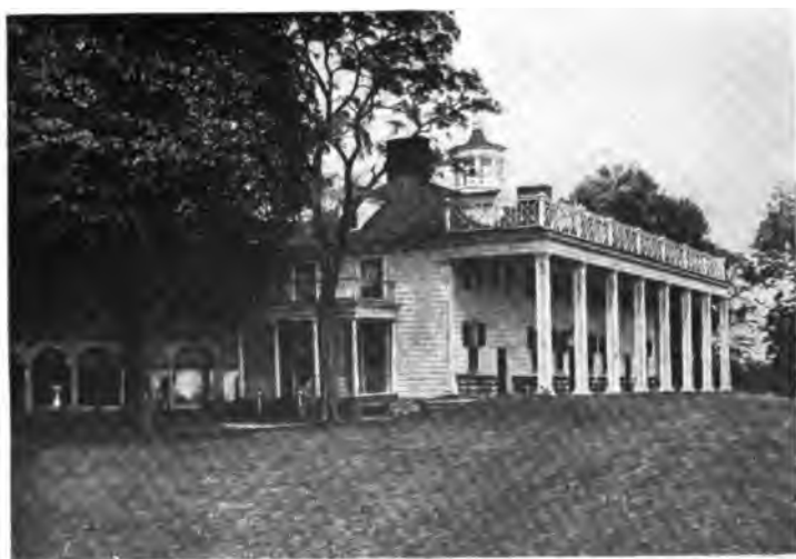
Mt. Vernon, Type of Virginia Homes.